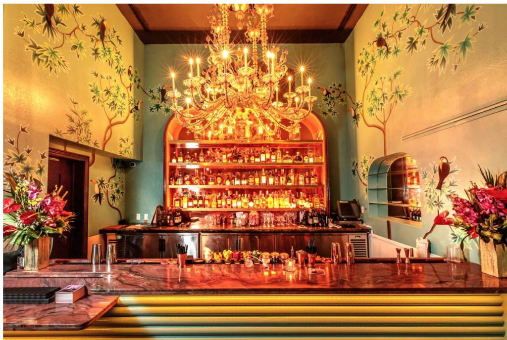
El Tucan HANDOUT

Recently reopened with new entertainment and a reimagined Asian-inspired menu, El Tucan is a lush, tropical lounge-meets-supper club where you can watch aerialists swing from the ceiling and listen to world-class singers while sipping creative craft cocktails and nibbling dishes like pork belly bao buns, spicy hamachi tacos and more. The resto-lounge serves food every day except Mondays and Tuesdays from 7 p.m. - 3 a.m.